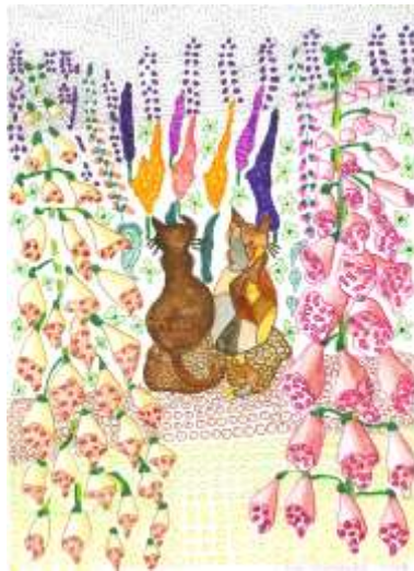
Cats in the Garden